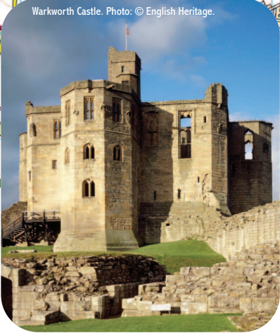
Warkworth Castle.