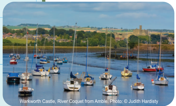
Warkworth Castle, River Coquet from Amble.

Cycle map: Scale 1:50 000 - 2cm to 1km - 1 1/4 inches to 1 mile based on Ordnance Survey 1:50 000 scale mapping.