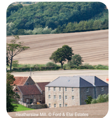
Heatherslaw Mill.

Produced by: The Cyclepad Ltd., Design: Ian Scott Design.