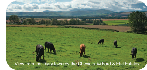
View from the Diary towards the Cheviots.